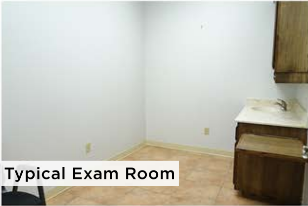
Typical Exam Room