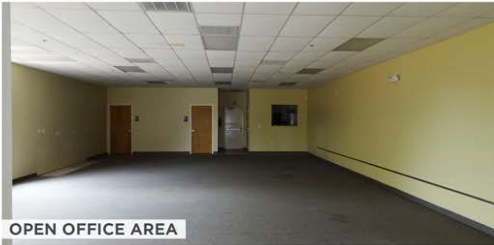
OPEN OFFICE AREA