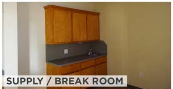
SUPPLY / BREAK ROOM