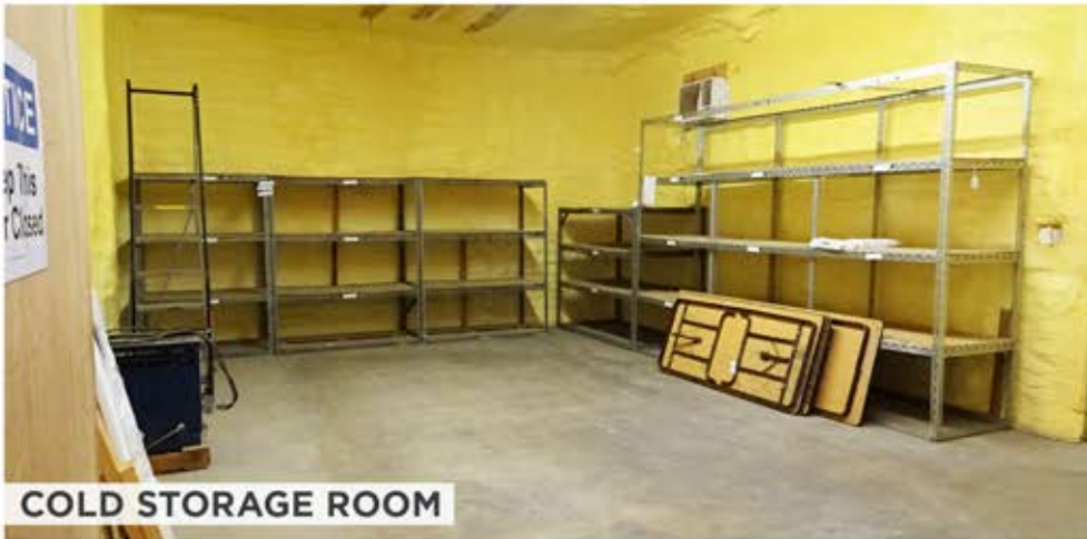
COLD STORAGE ROOM