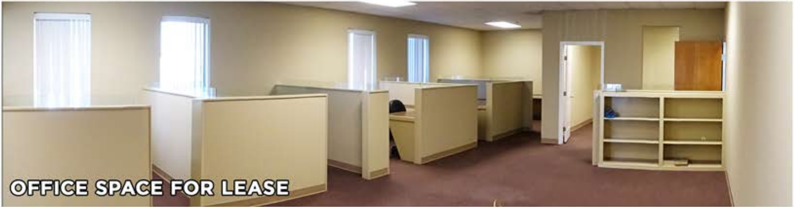
OFFICE SPACE FOR LEASE