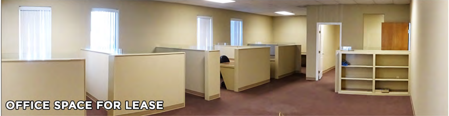
OFFICE SPACE FOR LEASE